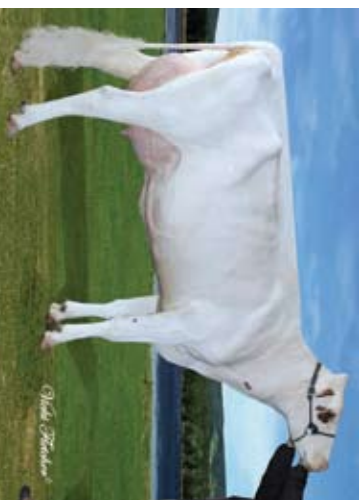
West Port Arron Doon Mit P-Red VG-2Y