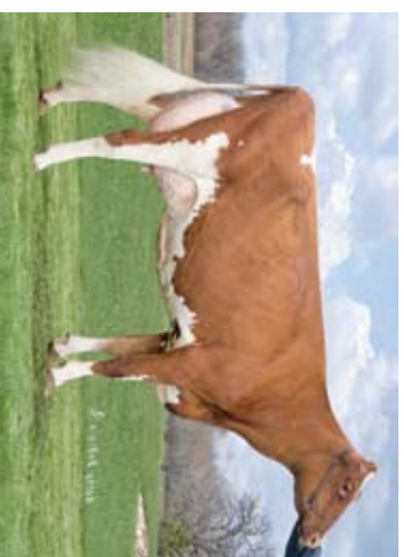
Windsor-Manor Reva-Red-ET EX-91